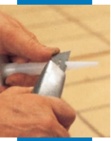
Cutting the nozzle according to the size of the joints