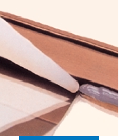
Sealing aluminium window frame with Mapesil AC

All relevant references of the product are available upon request.