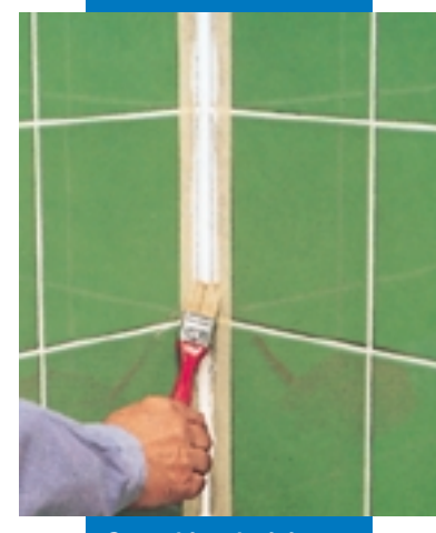
Smoothing the joint with soapy water and a small brush