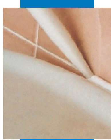
Sealing sanitary ware