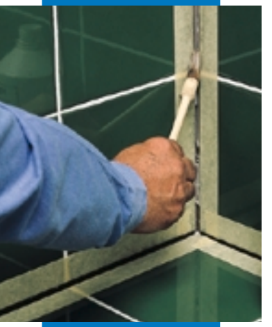
Application of Primer FD