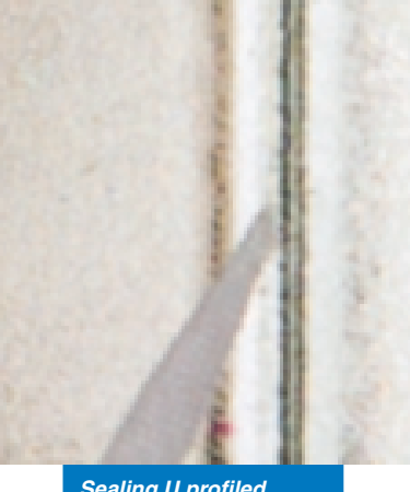
Sealing U profiled glass

Sealing of expansion joints or fitting different building elements in construction, with acetic-crosslinking coloured or transparent silicone sealant (e.g. MAPEI S.p.A. Mapesil AC or equivalent), which is able to absorb joint movements up to 20% of the width, after having first, if necessary, applied a fixing primer (e.g. MAPEI S.p.A. Primer FD or equivalent). The seal must be mildew-resistant and must remain unchanged even after many years of exposure to climatic extremes, industrial pollution, sudden temperature changes and immersion in water. A closed cell polyethylene foam cord (e.g. MAPEI S.p.A. Mapefoam or equivalent) must inserted into the joint.